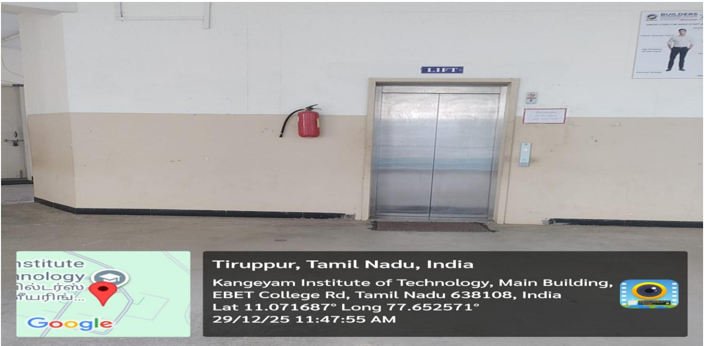
Lift Facility for Elderly and Disabled Persons