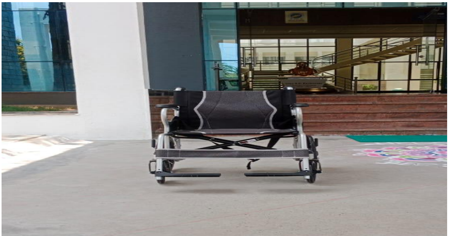
Wheel Chair for Elderly and Disabled Persons